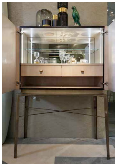
Art. 34117/R fin. MOS Bar cabinet inlaid doors cm. 112x50x167 h