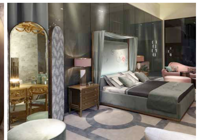
INTERIOR 5 BEDROOM