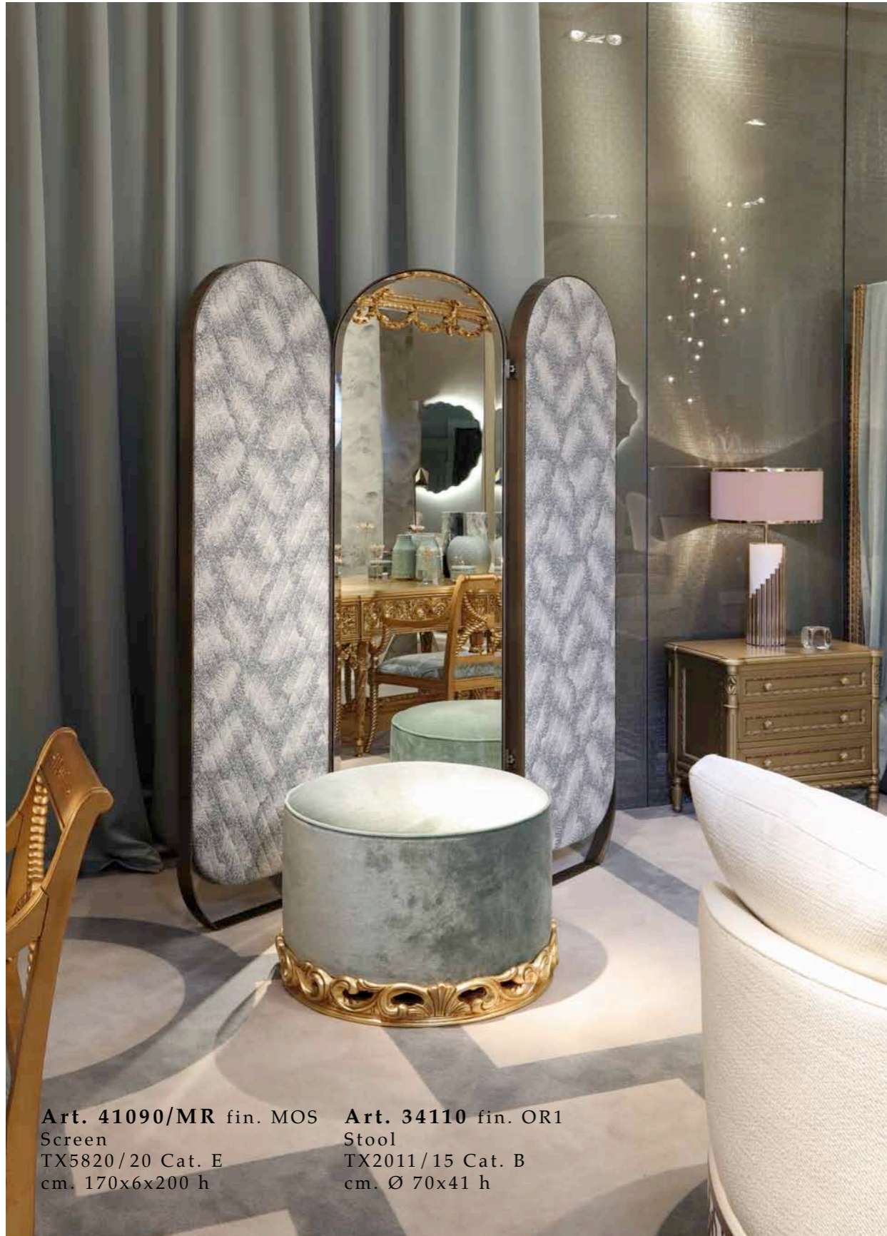
Art. 41090/MR fin. MOS Screen TX5820/20 Cat. E cm. 170x6x200 h