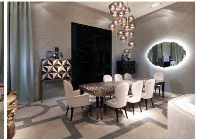
INTERIOR 3 DINING