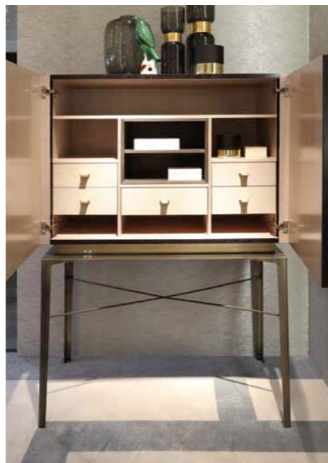
Art. 34118/R fin. MOS Cabinet inlaid doors cm. 112x50x167 h