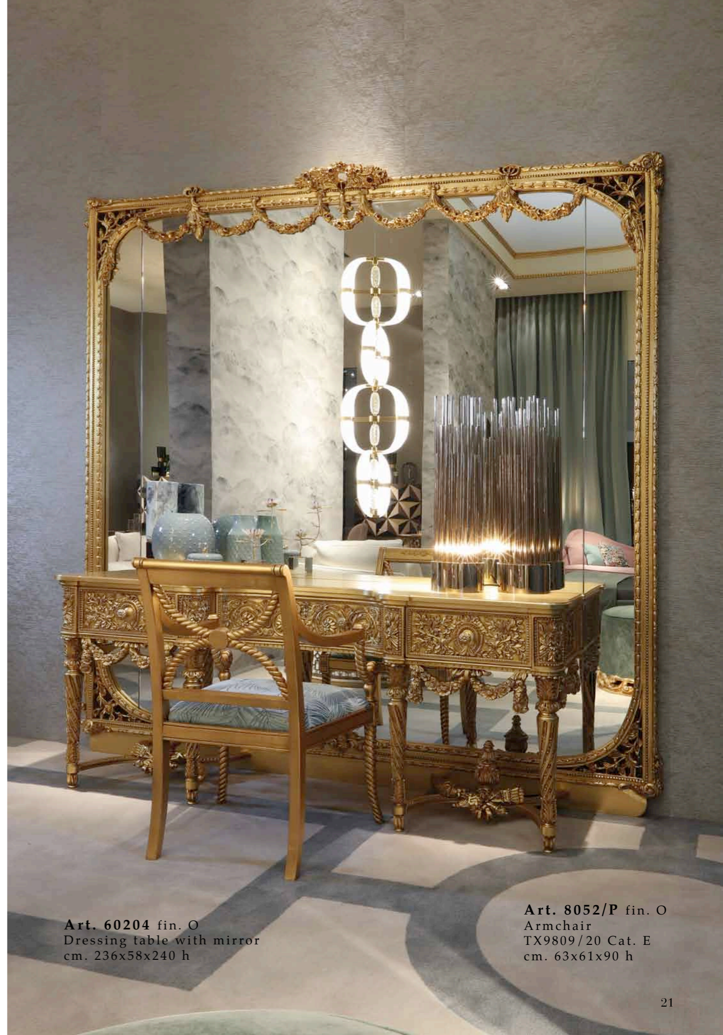
Art. 60204 fin. O Dressing table with mirror cm. 236x58x240 h

20 | ANGELO CAPPELLINI _ Salone del Mobile Milano 2018