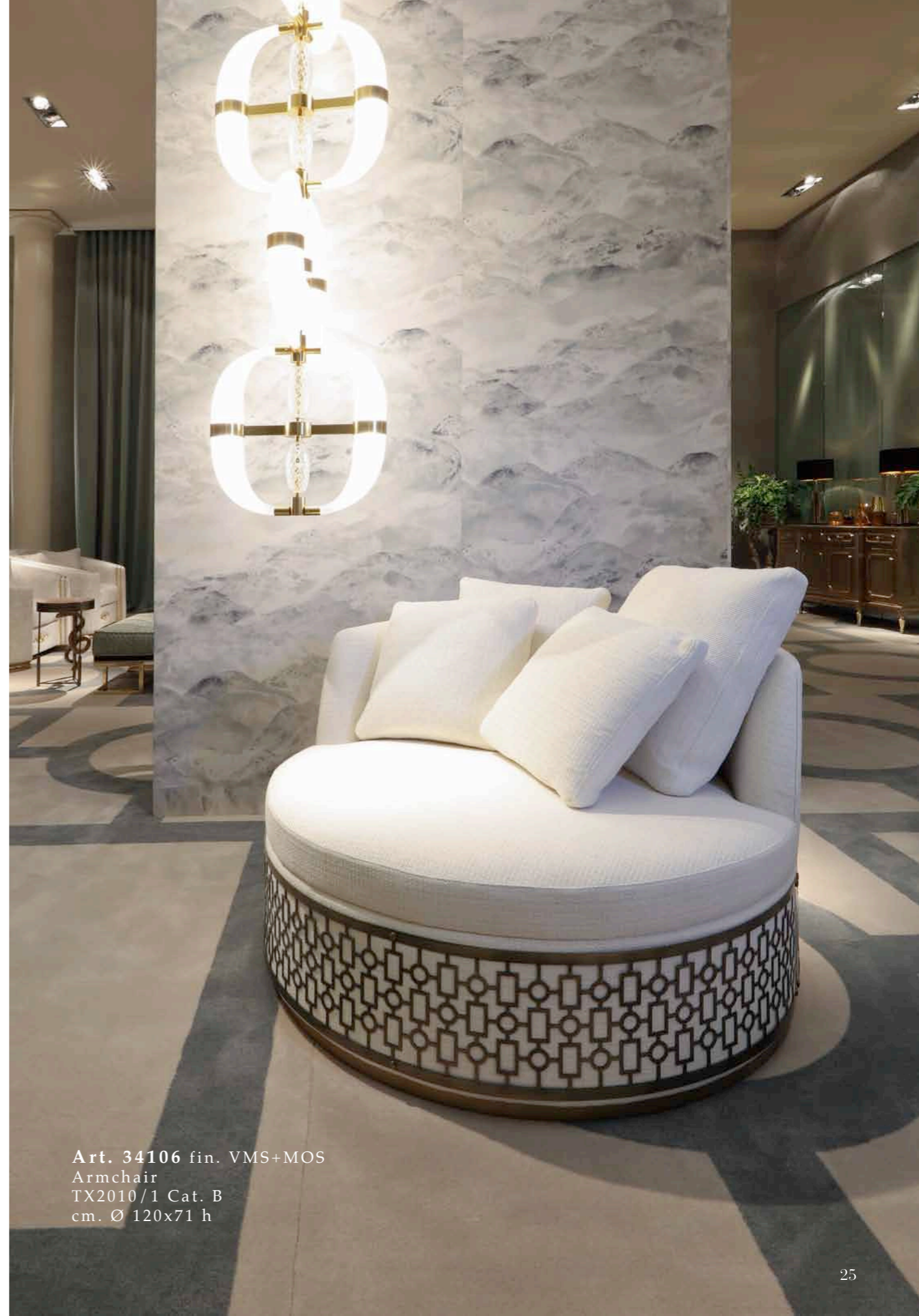
Art. 34106 fin. VMS+MOS Armchair TX2010/1 Cat. B cm. Ø 120x71 h