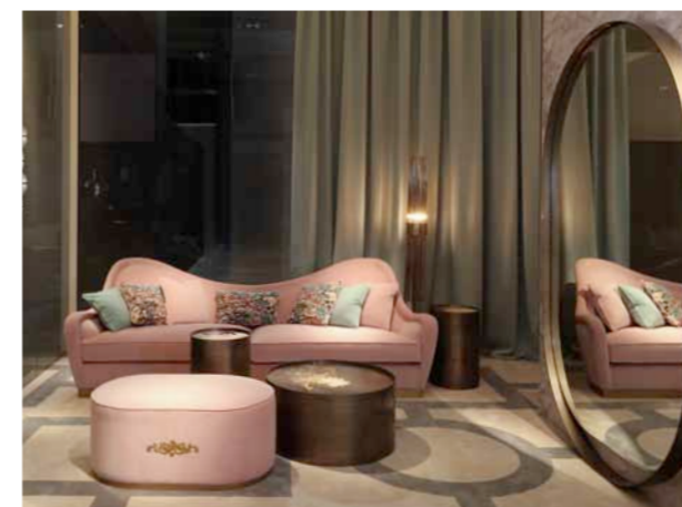
INTERIOR 4 BOUDOIR