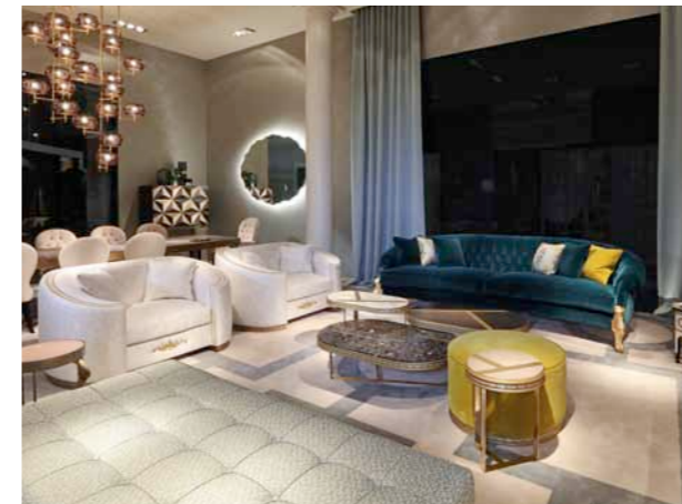
INTERIOR 2 LIVING ROOM