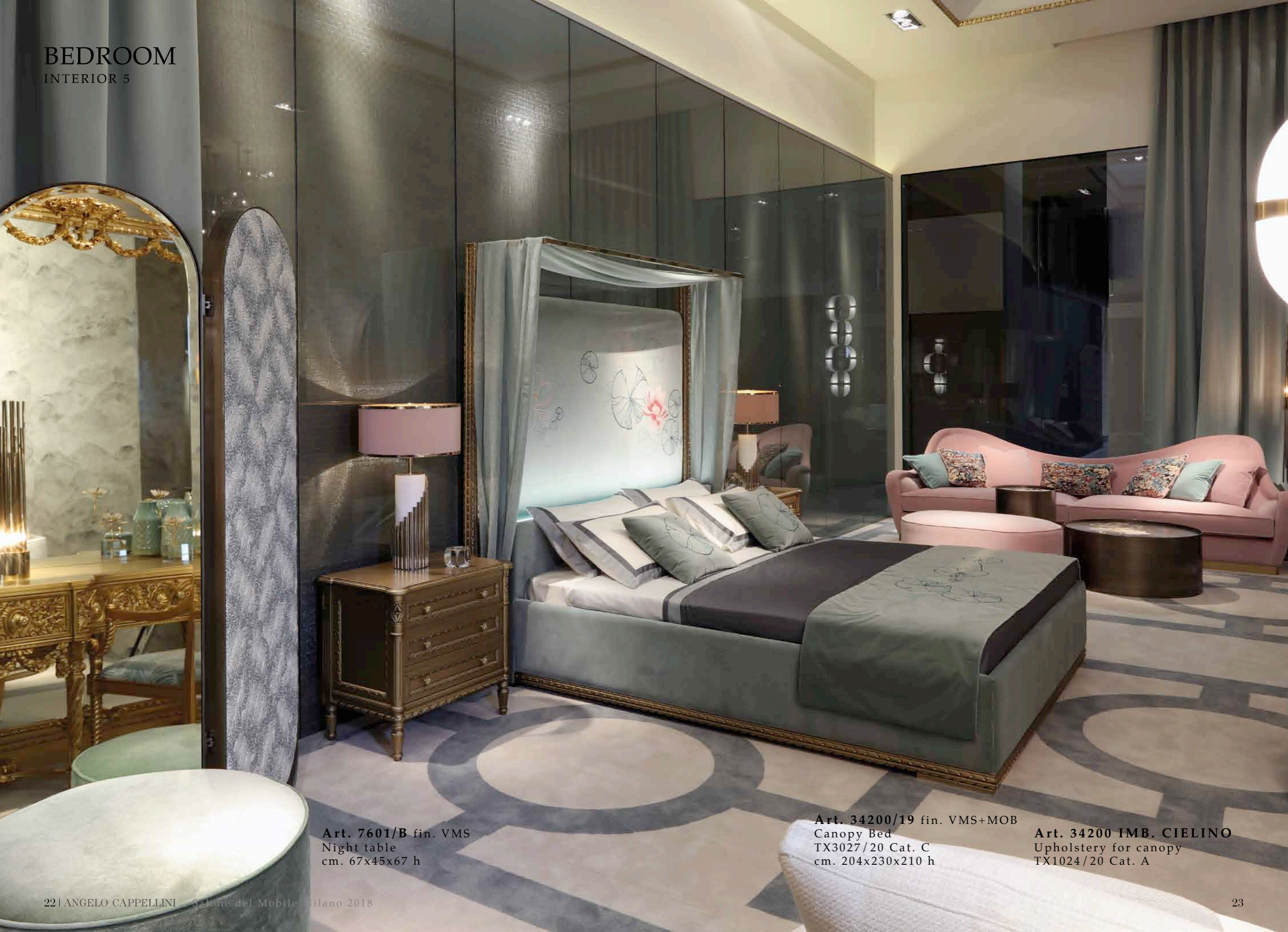
Art. 7601/B fin. VMS Night table cm. 67x45x67 h