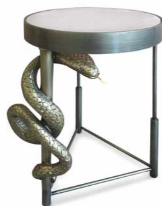
Art. 34300 fin. VMS+MOS Side table Special marble top pink Onix cm. Ø 35x55 h