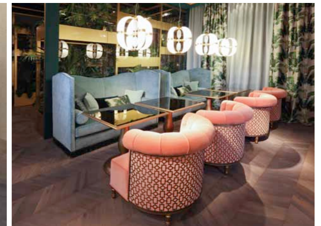
INTERIOR 1 LOUNGE