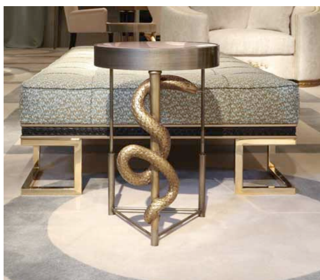
Art. 34107 fin. NCH+MOB Day bed TX3034/20 Cat.C cm. 200x90x41 h