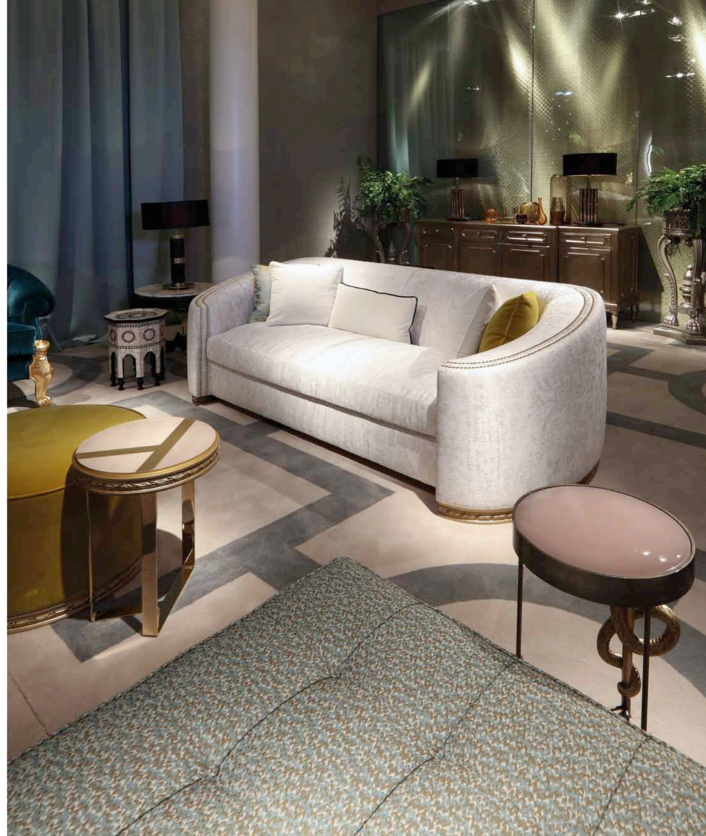
Art. 34104/D3 fin. VMS 3 seat sofa TX4127/1 Cat. D cm. 220x100x81 h