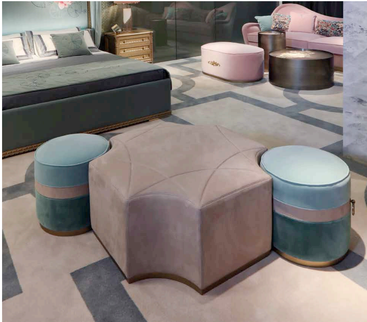
Art. 34111 fin. VMS Stool with embroidery PX9915 Cat.E cm. 90x90x40 h