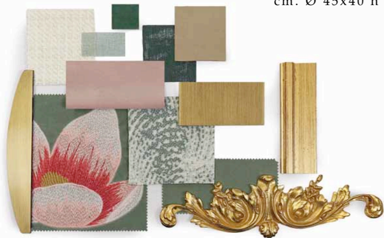
Art. 34112 fin. VMS Stool TX3010/20 Cat.C (upper part) PX9915/Cat.E (band with MOS accessory) TX3010/5 Cat.C (bottom part) cm. Ø 45x40 h

20 | ANGELO CAPPELLINI _ Salone del Mobile Milano 2018