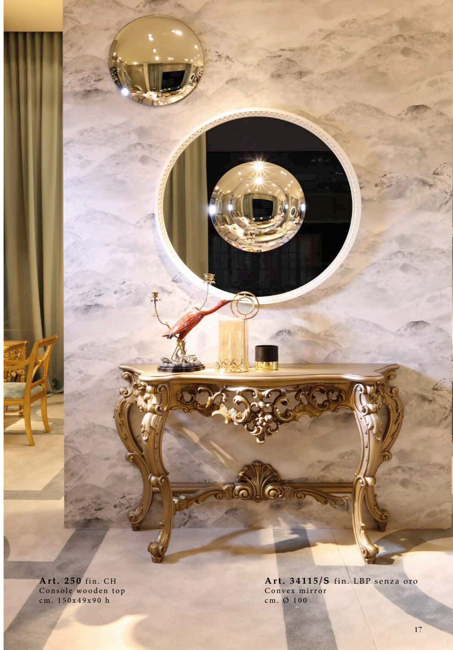
Art. 250 fin. CH Console wooden top cm. 150x49x90 h